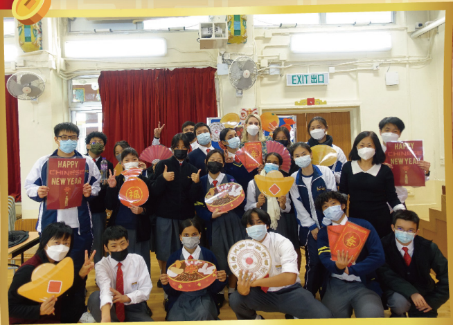
English Ambassadors at the Chinese New Year Carnival