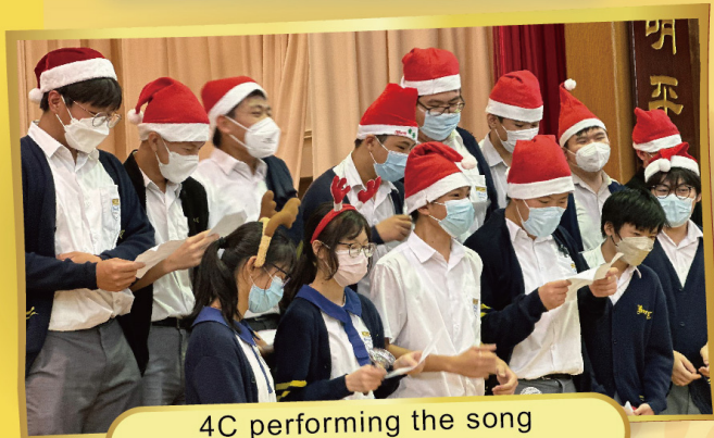
4C performing the song 'Jingle Bell Rock'