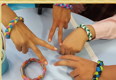
Visitors showing off their colourful upcycled tape bracelets