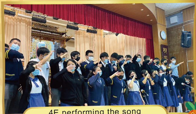
4E performing the song 'I Want It That Way'