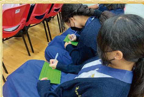
English Ambassadors signing their commitment pledges