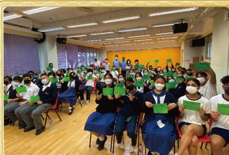
The 2022-2023 EA team with their signed pledges