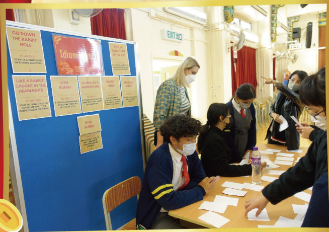
Students learning rabbit idioms at one of the Chinese New Year Carnival game booths