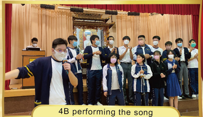
4B performing the song 'Good Time'