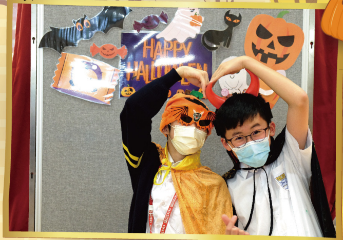
Students dressing up for the Halloween Carnival photo booth