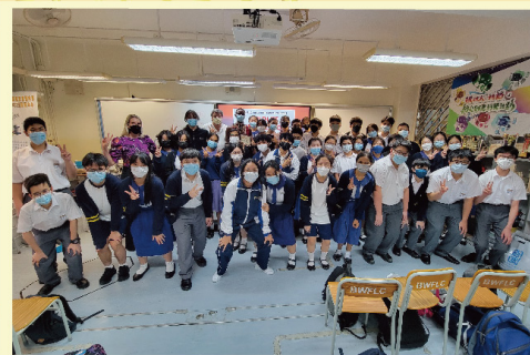
English Ambassadors at The Elephant Foundation Talk