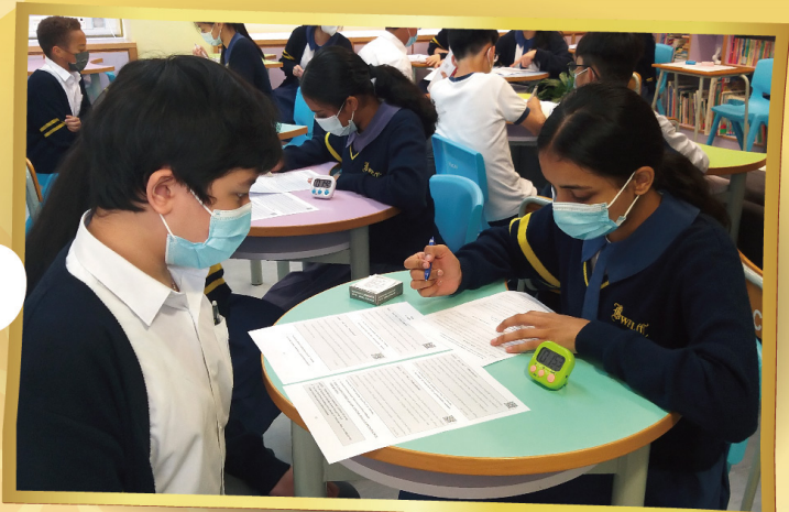
English Ambassadors helping junior form students with their Readathon tasks in the English Corner