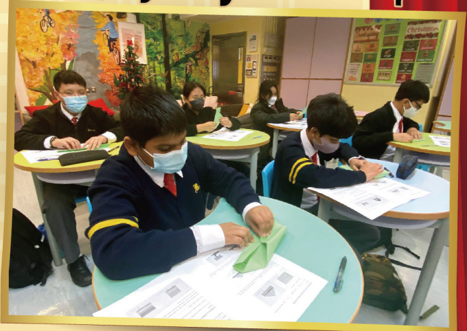
Students learning how to upcycle used paper into envelopes