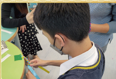
A visitor learning how to make a bracelet using upcycled tape