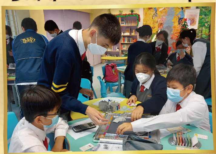
Students learning how to play Monopoly in the Board Games Workshop