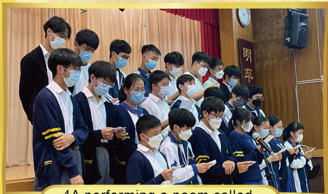
4A performing a poem called, 'Homework. Oh Homework'