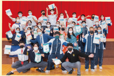
The 2022 – 2023 Speech Team