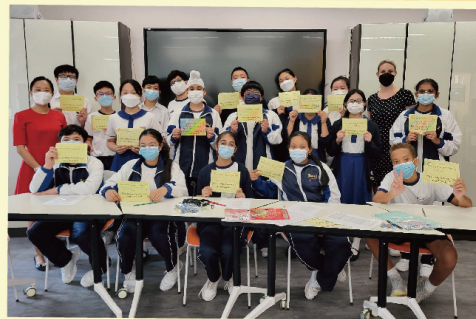
Speech Team members at their goal-setting session