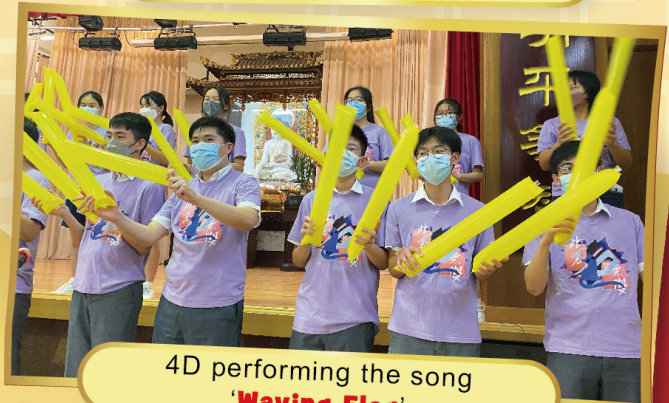
4D performing the song 'Waving Flag'