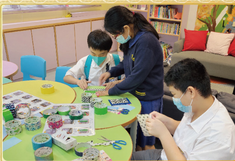
English Ambassadors showing visitors how to make coin purses by upcycling tape