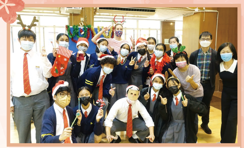
English Ambassadors at the Winter Carnival.