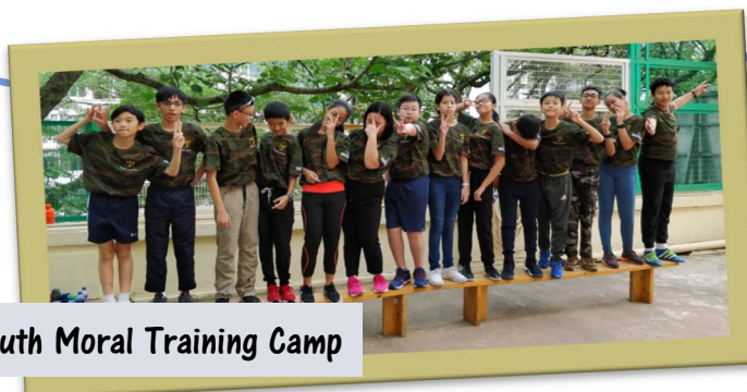
Youth Moral Training Camp

Despite their busy school life, the S1 and S2 students went out of campus to have fun in Moral Training Camp and Outdoor Learning Day respectively. Let's take a look at the places they visited!