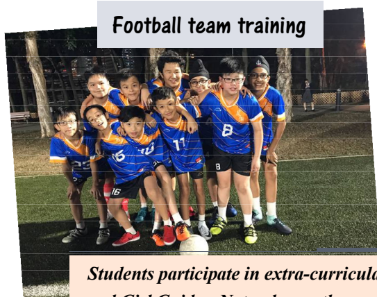
Football team training