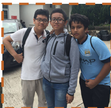
Outdoor Learning Day