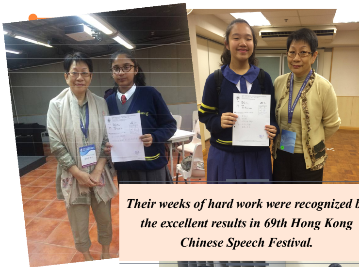
Their weeks of hard work were recognized by the excellent results in 69th Hong Kong Chinese Speech Festival.

The school is devoted to developing students' proficiency in Chinese . Most of the NCS students either have training for Chinese poem recitation in Chinese Speech class or practise basic daily conversation in Cantonese class. Below is the highlights of the classes and other extra-curricular activities.