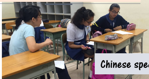
Chinese speech training

The school is devoted to developing students' proficiency in Chinese . Most of the NCS students either have training for Chinese poem recitation in Chinese Speech class or practise basic daily conversation in Cantonese class. Below is the highlights of the classes and other extra-curricular activities.