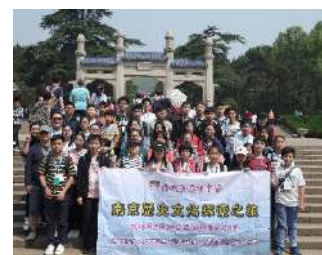
Historical and Cultural Study Tour to Nanjing