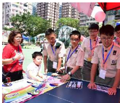
Activity booth and community service hosted by the Boy Scouts