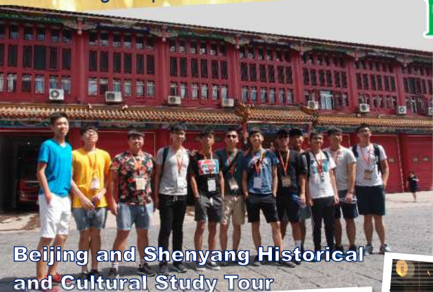
Beijing and Shenyang Historical and Cultural Study Tour

A journey of a thousand miles begins with a single step. Our school has been organizing a variety of cross-border study tours in order to broaden students' horizons and nurture student leaders. Each year, over 200 students participate in the study tours, destinations include Beijing, Nanjing, Hubei, Fujian, Guangdong, Macau, Taiwan, Thailand, South Korea, etc.