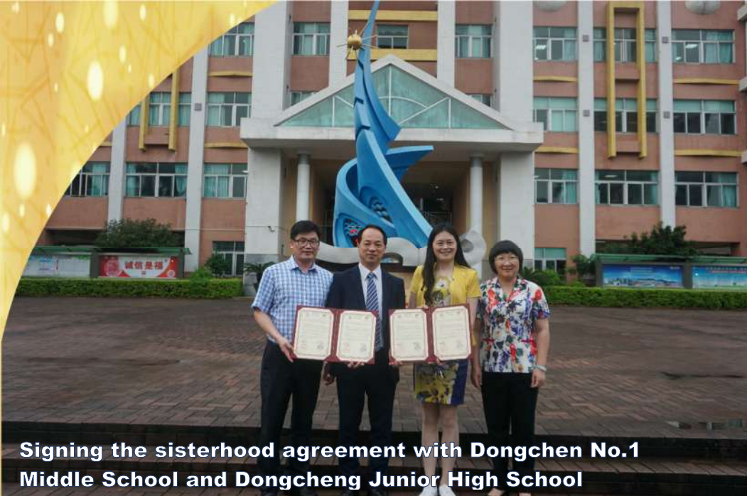
Signing the sisterhood agreement with Dongchen No.1 Middle School and Dongcheng Junior High School