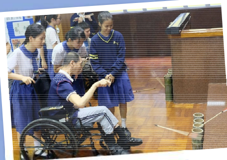
Volunteer Team Sharing