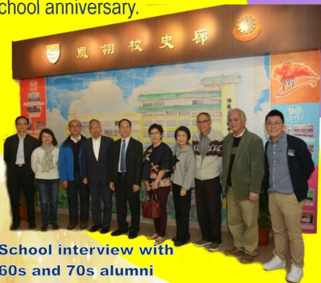
School interview with 60s and 70s alumni

Although the alumni of BWFLC have graduated for a long time, they often return to school to share their experiences, also enthusiastically support and assist in the preparation of the school anniversary.