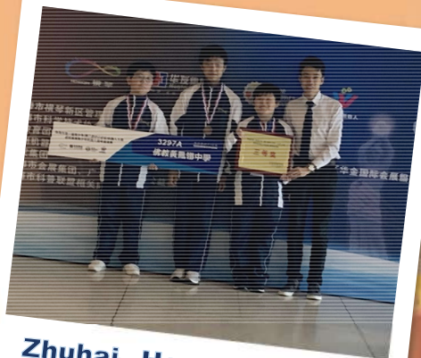
Zhuhai-Hong Kong-Macau Youth Robotic Invitational Tournament