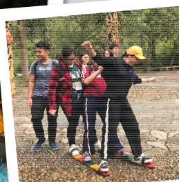
Exploring tour of culture and landforms in Nanning and Detian, Guangxi