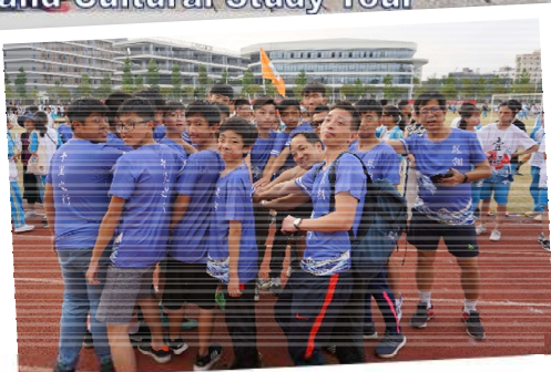
Hong Kong and Dongguan Student Cultural Exchange and Dongguan Historical Buddhism Culture Study Tour