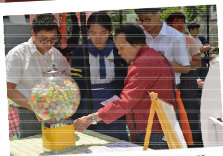
Hong Kong Island Buddha-bathing Activity

Apart from student's academic performance, the School also shows great concern to cultivating students' moral character. We often organize different volunteer activities and social welfare activities to enhance students' sense of citizenship and social responsibility.