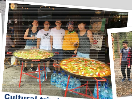
Cultural trip to Bangkok