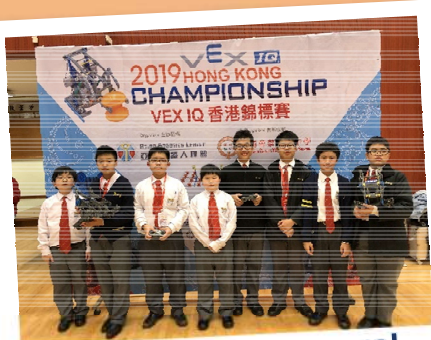
Students winning several awards in the VexIQ Hong Kong Championships: Golden Award, Jury Awards, Team League 1st runner-up

In order to create a rich learning experience for students, the School encourages students to participate in a variety of activities, including STEM, volunteer services, off-campus competitions and programs.