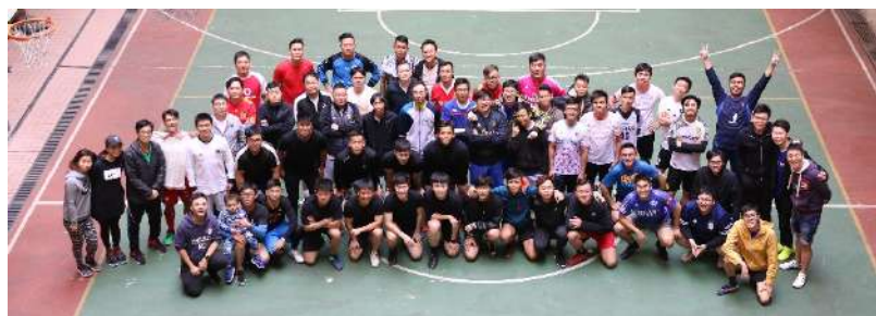
Diamond Jubilee Football Competition

On the 60th anniversary of the School, we have prepared a series of celebration activities, including the Diamond Jubilee Celebration and Landmark Opening Ceremony, the Diamond Jubilee Banquet, Diamond Jubilee Open Day, 60th Anniversary Badges, Mascot and Entrance Ticket Design Competition, Diamond Jubilee Ball Game Competition, etc.