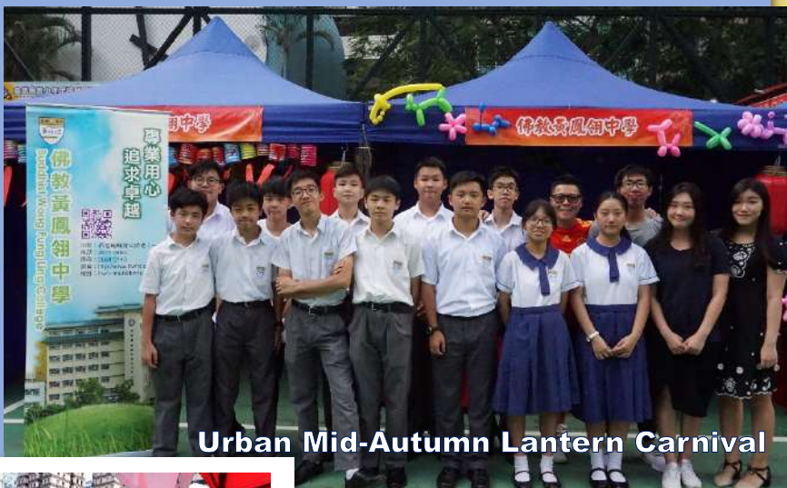
Urban Mid-Autumn Lantern Carnival