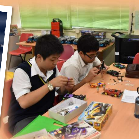
Form 2 Fast and Furious AWD Competition