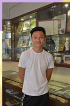
CHU POK YUEN CityU