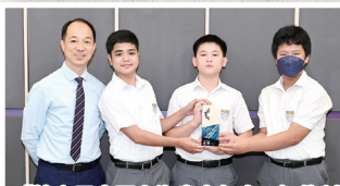
「第六屆中國上海青少年人工智能創新大賽」VEX IQ 機械人比賽 初中組亞軍