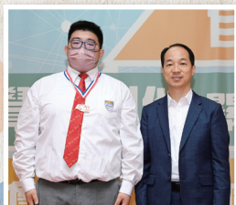
公民田徑錦標賽——男子乙組U18 鐵餅 季軍 灣仔區分齡田徑比賽——男子D組——鐵餅 亞軍、鉛球 季軍 南區分齡田徑比賽——男子青少年D組-鉛球及鐵餅 冠軍