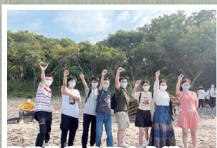
世界地質公園文化遊——鴨洲/東平洲/吉澳

The School encourages students to step out of the classroom and get to know their community. There are numerous local excursion destinations, such as Lantau Island, the Stanley Military Cemetery, the Patriotic Education Center, the Tung Ping Chau Geopark, the PLA Hong Kong Garrison Exhibition Center, and the Greater Bay Area Youth AI Development Center.