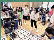
STEM X 中華文化