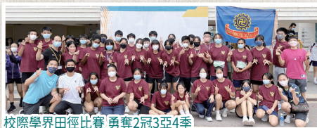
校際學界田徑比賽 勇奪2冠3亞4季 全港佛教中學第29屆聯校運動會——囊括個人及團體獎，共6冠3亞4季及多個優異獎項。