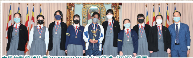
中學校際籃球比賽(DIVISION ONE)女子籃球 (甲組) 季軍