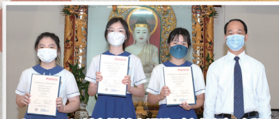
RoboParade創意機械人巡遊 (高級組) 金獎