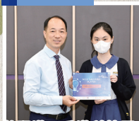
數碼港、香港科技園 STEM+E (MVP)