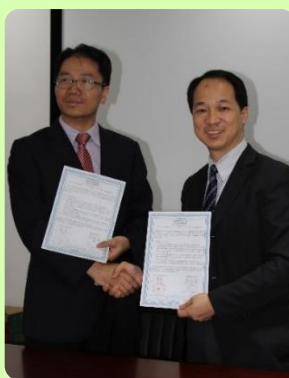
Song Shan Experimental School in Dong Guan, China Prestigious in technology education and now vowed sister-school with our school