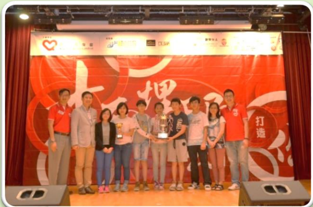
The school Volunteer Team participated in 「十面埋服」 held by VQ Foundation Limited and got the 1st prize of School Group Section

A total of 4918 hours of service recorded from 2014-2016, 4 were awarded Golden Prizes, 12 Silver Prizes, 46 Bronze Prizes and 3 nominated for 5-year Long Service Awards in Volunteer Campaign Team under Social Work Department. 4 students were also honoured of their contribution with Gold Commendation by both the Wanchai and Eastern District Voluntary Service Promotion Committees.