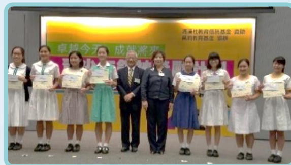
Students being conferred with awards in Today's excellence for tomorrow's leader programme 2016 of Young Leaders Project. They also won Outstanding Member Award in 2016 Youth Korean Exchange Program held by Community Youth Club under Education Bureau