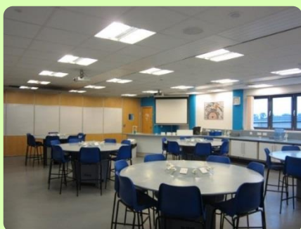
STEM Resource Centre (under construction)