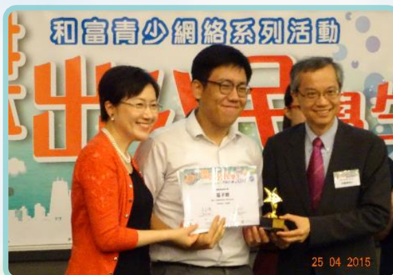
Student won the Ten Best Citizens Award commissioned by Wo Fu Outstanding Student Citizen Award Scheme in 2014