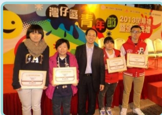
A total of 9 students being conferred with Outstanding Youth Award in Wanchai Outstanding Youth Election commissioned by Wan Chai District Youth Programme Committee from 2013 – 2016